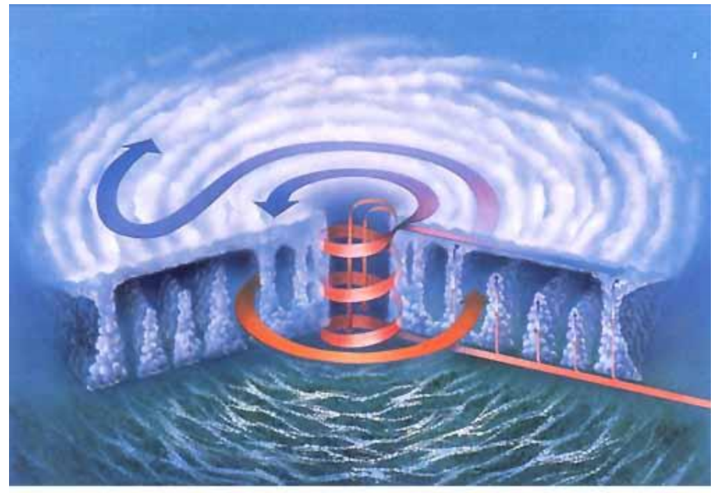
Cross section of a hurricane showing wind currents

As you can see, Hurricanes are a bit more complicated than meets the eye. The Hurricane is actually rotating both counter-clockwise and clockwise near the Eye (the center and calm area of the phone), while the Coriolis Effect is what ultimately causes the overall spin of the Hurricane. This also explains the cycling effect that occurs within the hurricane.